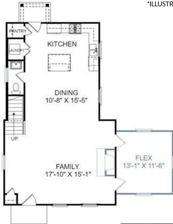
Main Level Floorplan with options