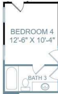
Bed 4/Bath 3 ILO Flex